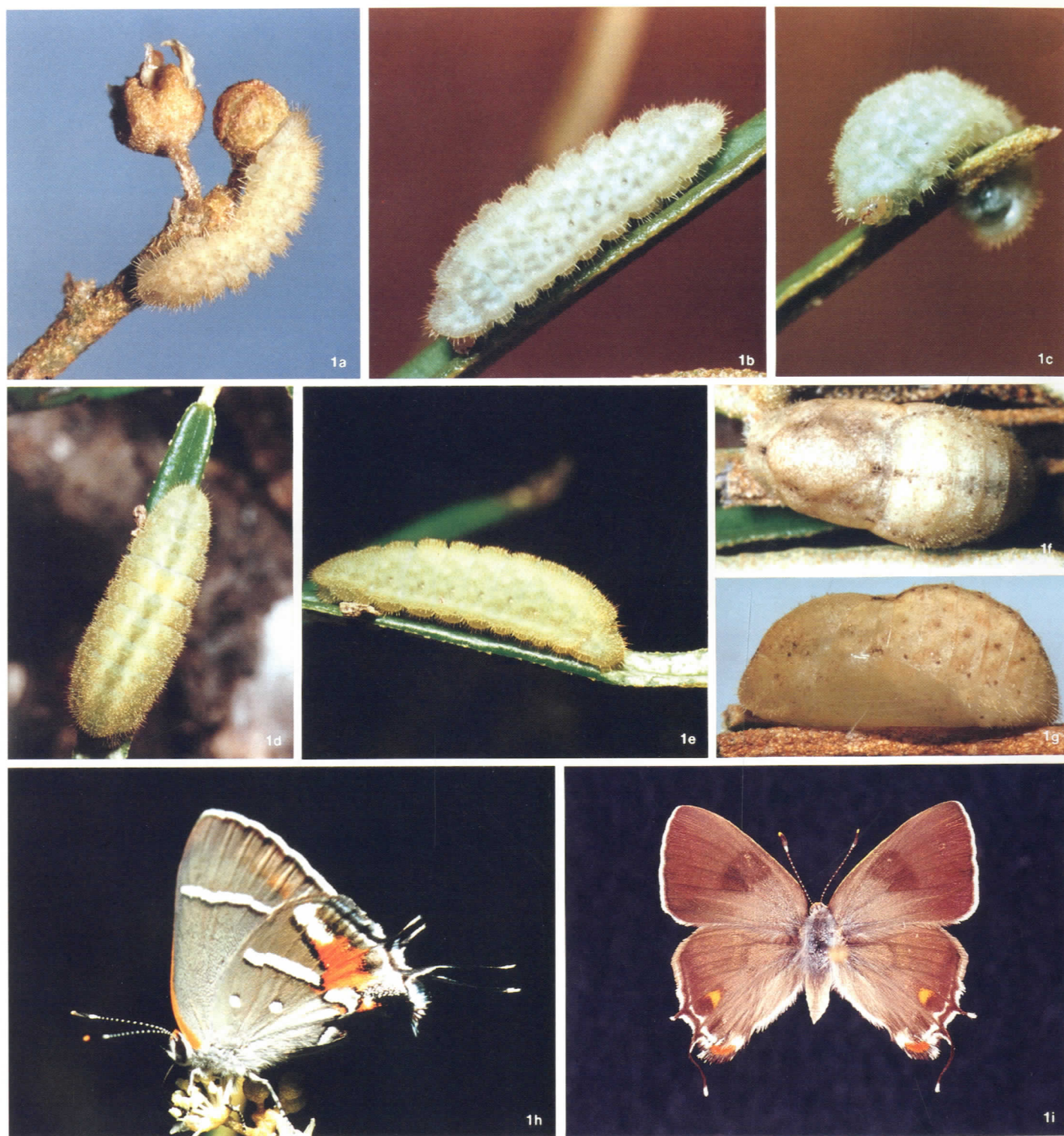
Fig. 1. Strymon acis bartrami . (a) 3rd instar larva feeding with head buried in Croton bud; (b) 4th instar on Croton leaf; (c) 4th instar with head extended; (d) 5th instar, dorsal view; (e) 5th instar, lateral view and skeletonized leaf damage; (f) Pupa, dorsal view; (g) Pupa, lateral view showing silken girdle; (h) Adult feeding at flowers of Croton linearis ; (i) Adult, dorsal surface of female.